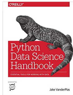
Figure: Python Data Science Handbook [Amazon][Free web version]